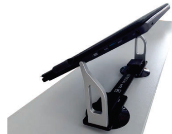
Tablet holder with suction cup or magnet.