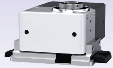
Base plate vertical

Feather-light and gentle moving, perfect positioning and stable measurement