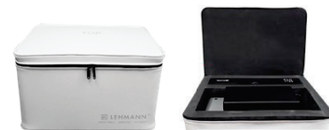
QuickBox – high-quality box made of white leather for safe and careful transport